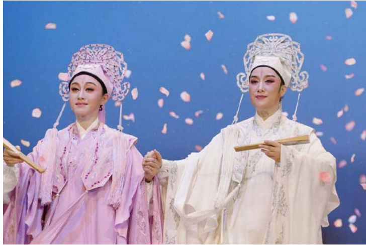
Figure 2 Video of Yue opera's "Liang Zhu"