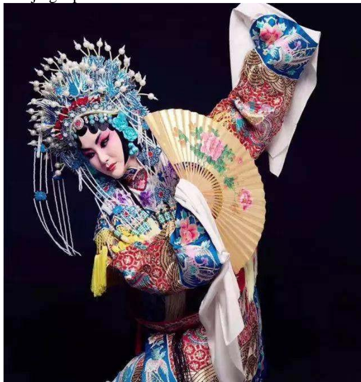
Figure 1 Beijing opera's "The Princess Drunk" performance

workers, relevant experts, folk artists have played an important role in the protection of opera culture. However, some opera cultural groups and folk art groups have fewer opportunities to display opera culture, and there is no sufficient time and space to publicize opera culture. Moreover, some associations and institutions are not perfect for their own management and management mechanism, and the government's support and assistance to such departments is low, which leads to the inability of opera culture to perform effectively, which affects the construction of opera culture protection mechanism. At present, the development mechanism of opera culture itself is not perfect, in the process of the development of opera culture, there is a phenomenon of its own development by the department attached to the market construction. The development of opera culture can not communicate and help effectively with the opera culture management department, the market supervision department and the township government at all levels, and the phenomenon of information imbalance appears in the process of integration and construction. As shown in figure 1 for the performance of Beijing Opera's "Princess Drunk".